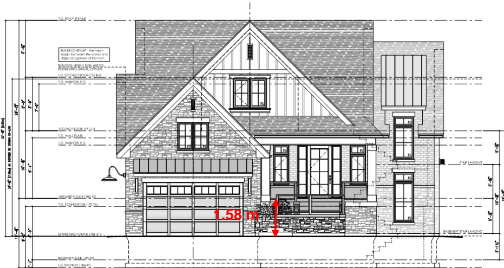
FRONT (SOUTH) ELEVATION SCALE: 1/4"=1'-0"

Note: Alternative formats available upon request.