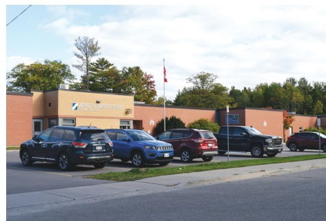
Worsley Elementary School meets the needs of families living in the west end of town. A fourth elementary school is planned for the south central part of the community. Most high schools students attend classes in nearby Collingwood, Stayner, or Elmvalle.

Publicly funded education in Wasaga Beach is available at three different schools.