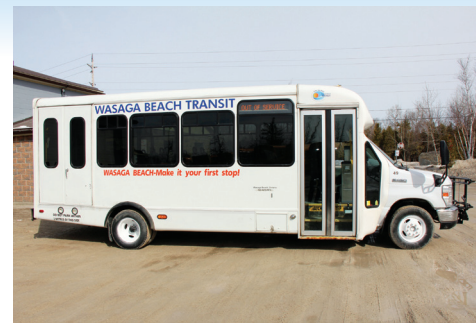
Wasaga Beach Transit is served by small buses like the one pictured. We have two transit routes in town. They run seven days a week. Connecting links are available to Collingwood and Barrie. From Barrie riders can access other destinations, including the GO Train and GO Bus to Toronto.

You can get around Wasaga Beach in a variety of different ways.