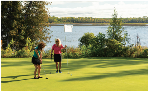
Wasaga Beach's Marlwood Golf and Country Club is a great place to play.

If you like to golf then Wasaga Beach and surrounding area offers plenty of spots to swing a club.