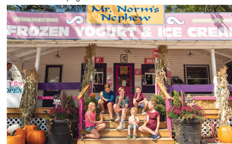
Our community is full of great little spots to explore. Looking for ice cream, cotton candy and other delectable treats? You need to check out Wasaga Beach.