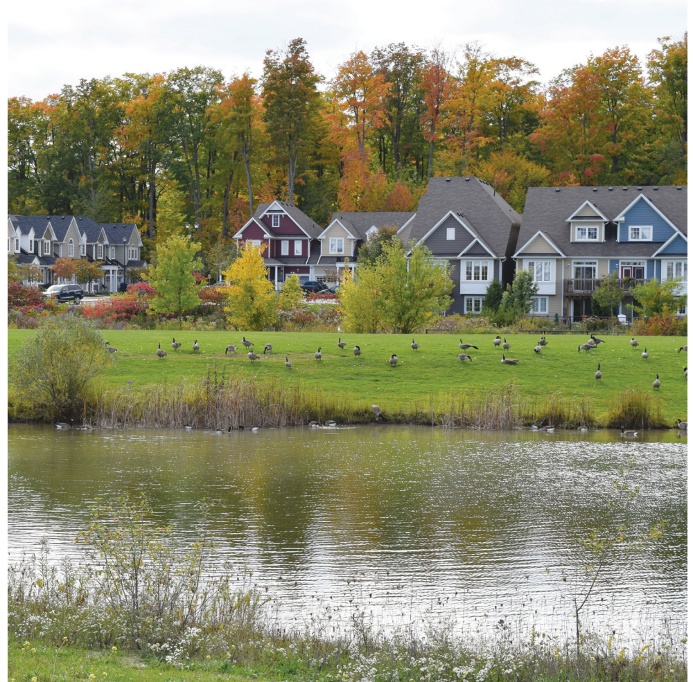
Wasaga Beach is an affordable place to live or own a weekend retreat. Properties in town also have great re-sale value.

For more information on the Parkbridge communities in Wasaga Beach, see www.parkbridge.com .