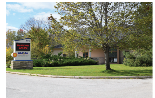
Wasaga Distribution is the local utility provider in Wasaga Beach. It provides electricity needs throughout the community.

To learn more about Wasaga Distribution and the valuable role it plays in supporting the people and businesses of Wasaga Beach, visit the company website at www.wasagadist.ca .