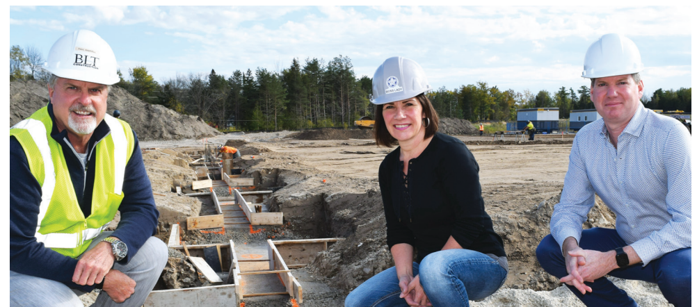
Footings for the new casino are going in. Mayor Bifulchi was on site recently to review the progress with the site supervisor and Gateway representatives.