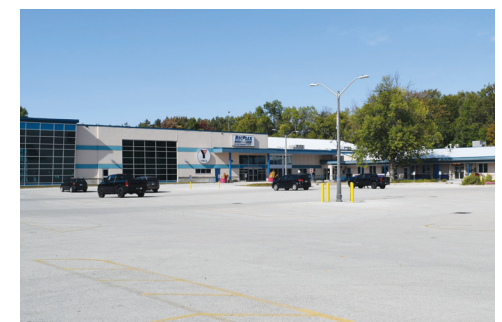
Our RecPlex is home to two swimming pools, exercise equipment, gymnasium space and meeting rooms. It is one of the busiest community facilities in town.