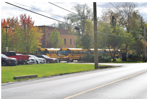
Birchview Dunes Elementary School services families living in the east end of the community.