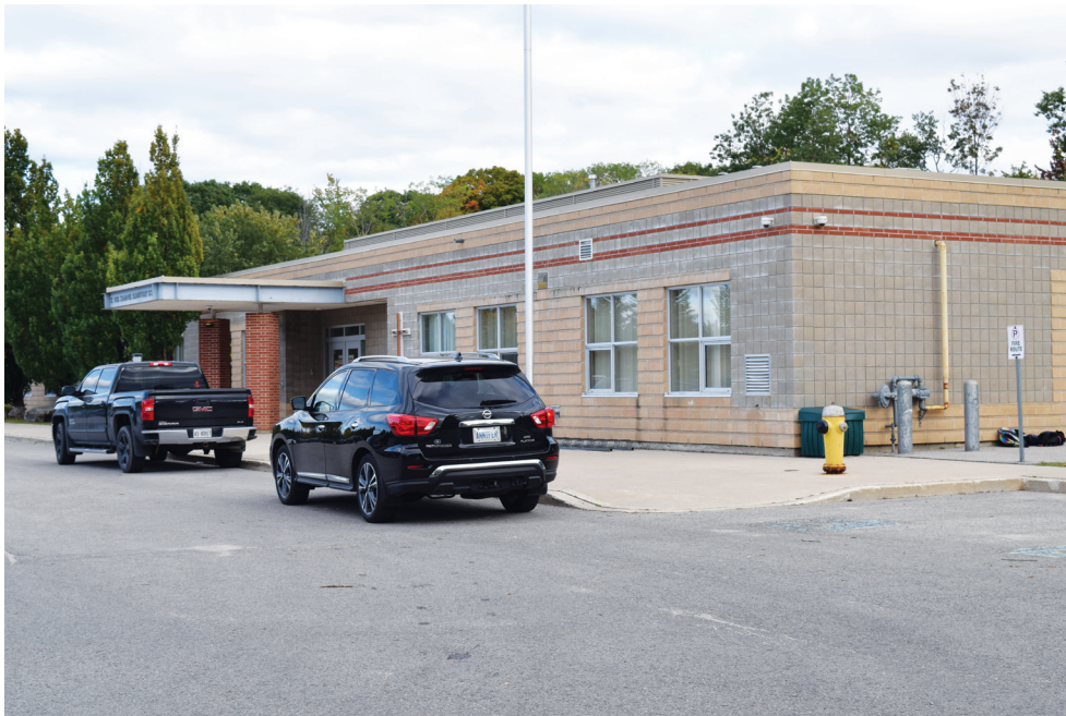
St. Noel Chabanel Catholic School in the west end of town serves Catholic families.