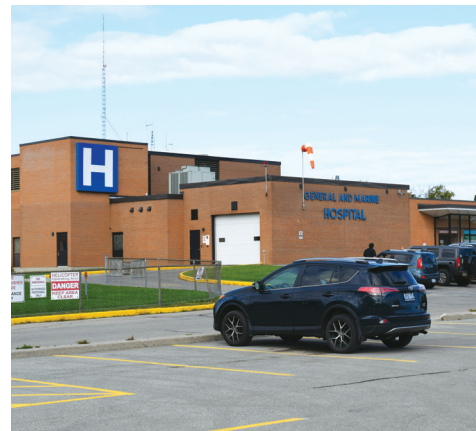
General and Marine Hospital in nearby Collingwood. The hospital is pursuing plans to build a new facility that will continue providing great service to the region.

Wasaga Beach is in close proximity to three hospitals and a community health centre.