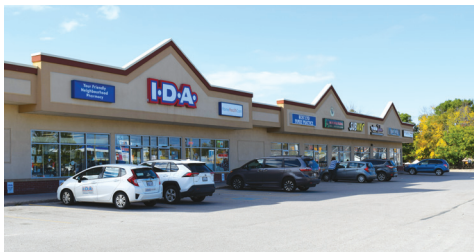
Plazas throughout Wasaga Beach are occupied by a variety of businesses, including drug stores, medical practices, places to dine, and hair salons.

Wasaga Beach is home to an array of shops and larger stores.