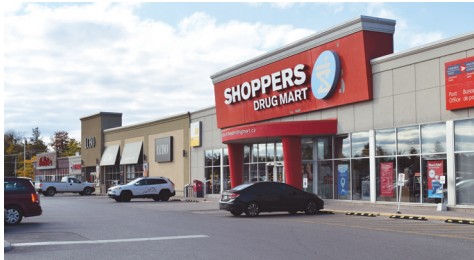
Finding what you need in a community is important. Wasaga Beach offers many different shops. These businesses also provide valuable employment opportunities.