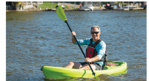
Kayaking on the Nottawasaga River is a beautiful experience. You will always see something new and interesting.