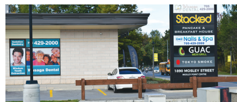
Stacked Pancake and Breakfast House, as well as Guac Mexi Grill, are two of the newest restaurants in Wasaga Beach. The town is home to a number of great places to eat. See our directory on www.wasagabeach.com to learn about other options.