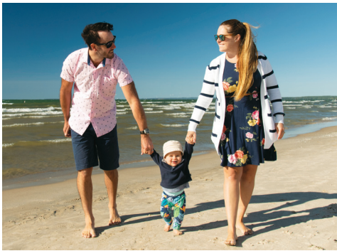
We're home to the longest freshwater beach in the world and we are proud of it. You can walk our beach 365 days of the year.