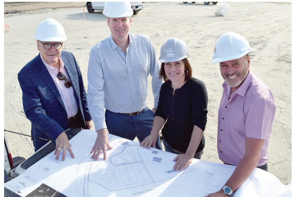
Construction of a casino, complete with great dining options, is underway in the west end of Wasaga Beach. Gateway Casinos is spearheading the project.

For more information about the casino project, see www.wasagabeach.com .