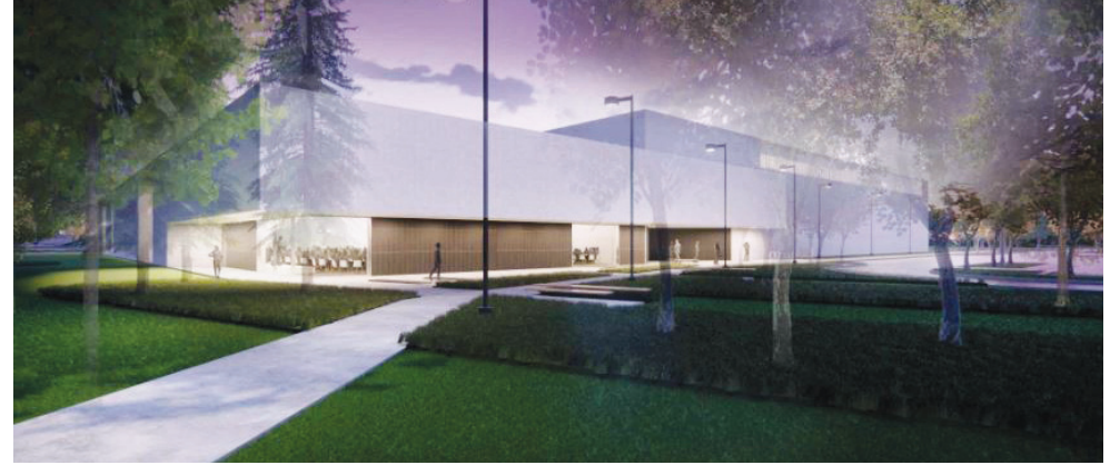
A rendering of the new twin-pad arena and library in Wasaga Beach. This depicts the east entrance.

Additional information about this project is on our website at www.wasagabeach.com on the Build Wasaga page and on our community engagement website at www.letstalkwasagabeach.ca .