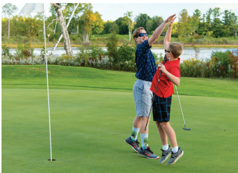
The region is also home to a number of other courses.

Monterra Golf at Blue Mountain Resort, opened in 1989, is home to 18-holes near the base of the escarpment, just 35 minutes west of Wasaga Beach. Like many other courses, Monterra offers a driving range, club rentals, and pretty much anything else you need for a great day of golf.