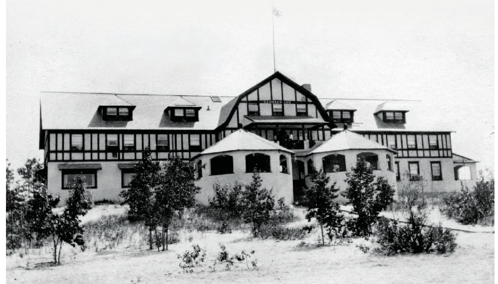
The Capstan Inn was a part of the main beachfront in Wasaga Beach for decades until it was demolished in the 1980s after reaching the end of its lifespan. The municipality is redeveloping town-owned land at the main beachfront. The goal is to create a revitalized area in the community for visitors and residents. A request for proposals process is currently taking place.

People can stay up-to-date on this project by visiting the Build Wasaga section of our website at www.wasagabeach.com . We are updating this section as the project moves forward. Background information on the project is also available for review.