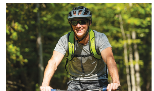
Cycling in Wasaga Beach Provincial Park is a beautiful way to experience our community. So peaceful. So quiet. And so much nature to see.