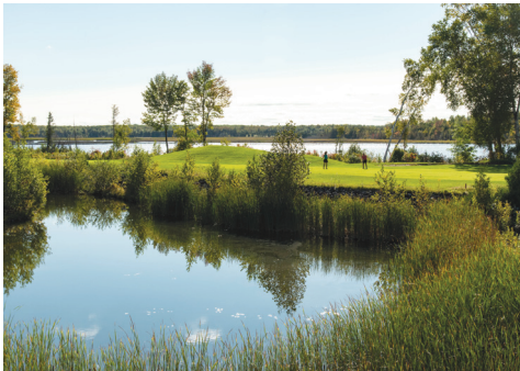
Taking in the scenery is easy to do in Wasaga Beach and surrounding area.