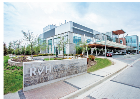
RVH in Barrie in the region's largest health care facility. It also provides cancer care services.

The hospital is working through a process that will ultimately lead to the construction of a new facility to serve the community. Learn more about the hospital at www.cgmh.on.ca .