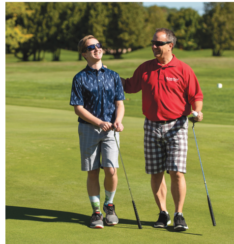
Young or old we guarantee you will make memories while playing golf in our community.

Springwater Golf Course Website: www.springwatergolf.com .