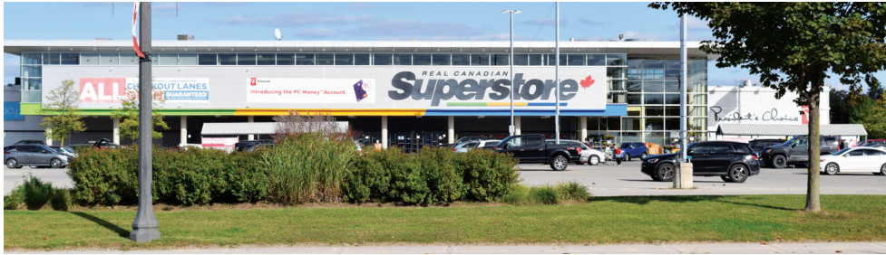
Wasaga Beach is home to three businesses offering groceries. Superstore in the west end of town, and Foodland and Walmart in the east end of the community. These stores offer a wide variety of choices.