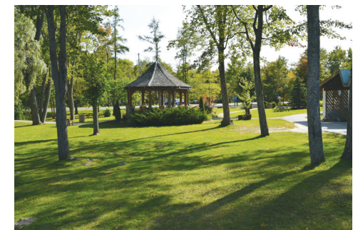
Wasaga Beach is home to dozens of parks and green spaces. The Oakview Woods Gazebo is a relaxing spot next to our RecPlex. In the summer months, our popular Jazz in the Park concert series takes place here.

Wasaga Beach has more than 100 kilometres of both on-road and off-road trails. These trails offer wonderful places to wander throughout the year. The town manages some of these trails, while the rest are part of Wasaga Beach Provincial Park. Be sure to check out our Story Book Trails. One starts at 40th Street South and Cardinal Way and the other at the eastern entrance of Silver Birch Avenue and River Road West.