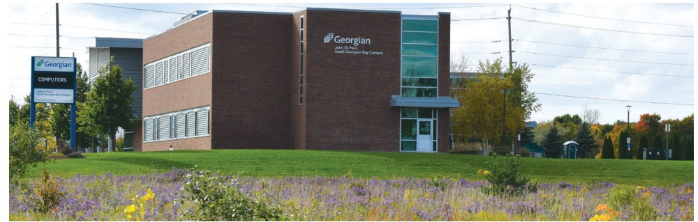
The South Georgian Bay Campus of Georgian College is just 20 minutes northwest of Wasaga Beach on the outskirts of Collingwood. The college has eight other campuses all within driving distance of Wasaga Beach. Public transit is available from Wasaga Beach to the South Georgian Bay Campus.

Although Wasaga Beach does not have any post-secondary institutions, the town is less than an hour drive to other Simcoe County communities that do offer such educational studies.