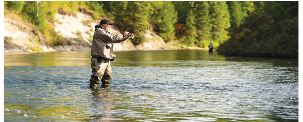
Fishing in the Nottawasaga River is a popular pastime with residents and visitors. Nottawasaga Bay offers great opportunities as well.

From Wasaga Beach, with the right charts, you can boat to other nearby communities, including Collingwood, Thornbury, Meaford, Penetanguishene, and Midland.