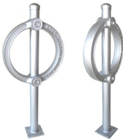
* Single/Bike Ring