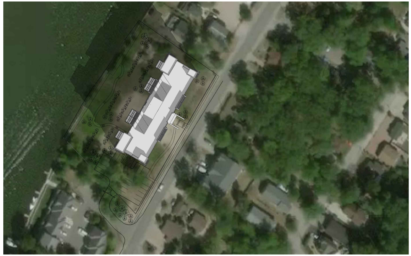
10:00 DEC 21 ADJACENT PROPERTY TO NORTH PARTIALLY SHADED, HOWEVER BUILDING NOT AFFECTED