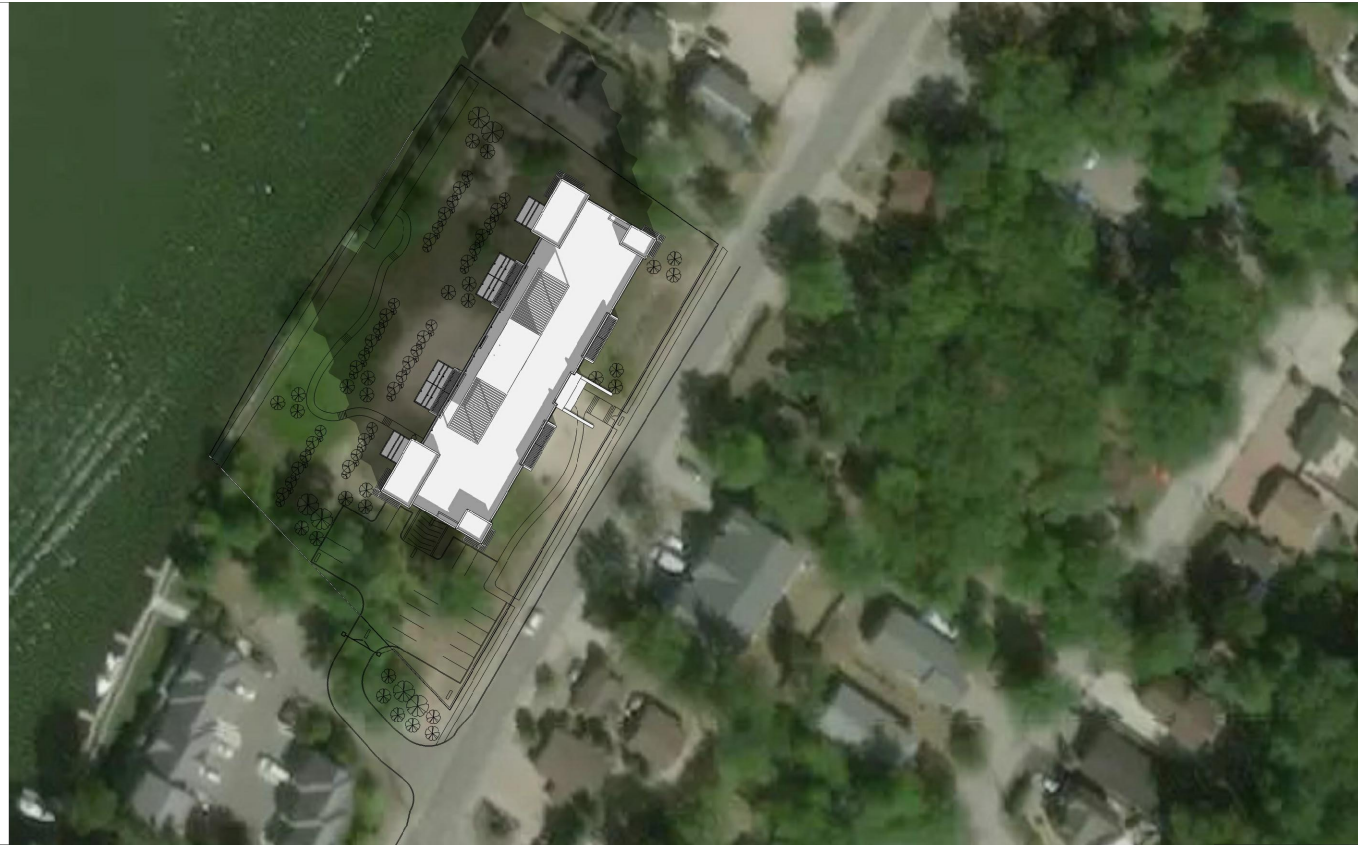
11:00 DEC 21 ADJACENT PROPERTY TO NORTH PARTIALLY SHADED, BUILDING PARTIALLY SHADED