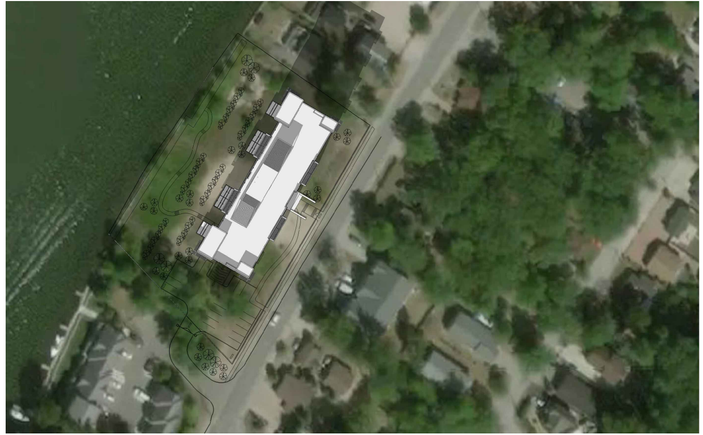
2:00 DEC 21 AFTERNOON SHADOWING AFFECTS 2 PROPERTIES TO NORTH, BUILDINGS PARTIALLY SHADED