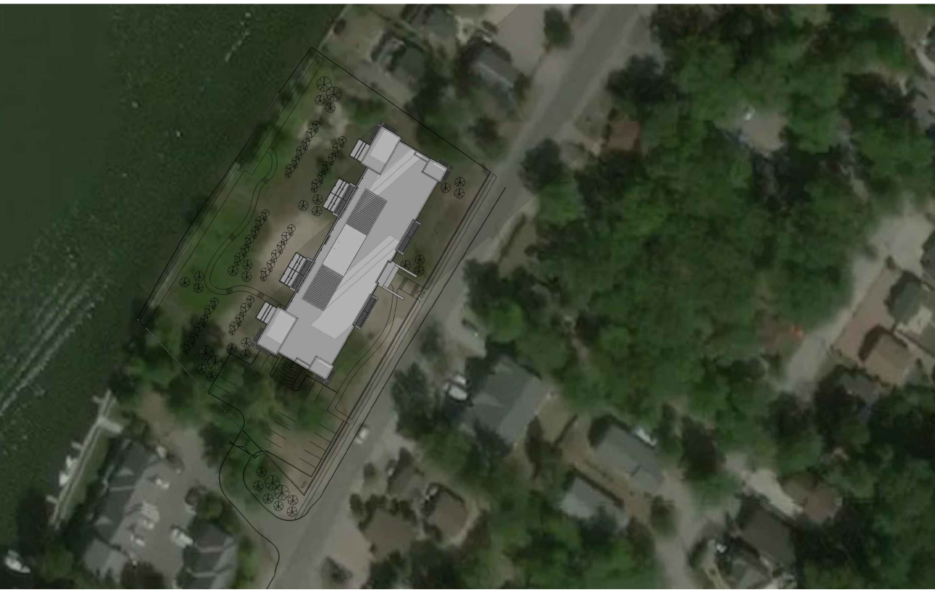
4:00 DEC 21 AFTERNOON SHADOWING AFFECTS 3 PROPERTIES TO NORTH, BUILDINGS PARTIALLY SHADED

SUMMARY: FEW ADJACENT PROPERTIES ARE AFFECTED BY SHADOW CASTING HOWEVER NO SINGLE STRUCTURE IS WITHIN THE PROPOSED DEVELOPMENTS SHADOWS FOR GREATER THAN 5HRS.