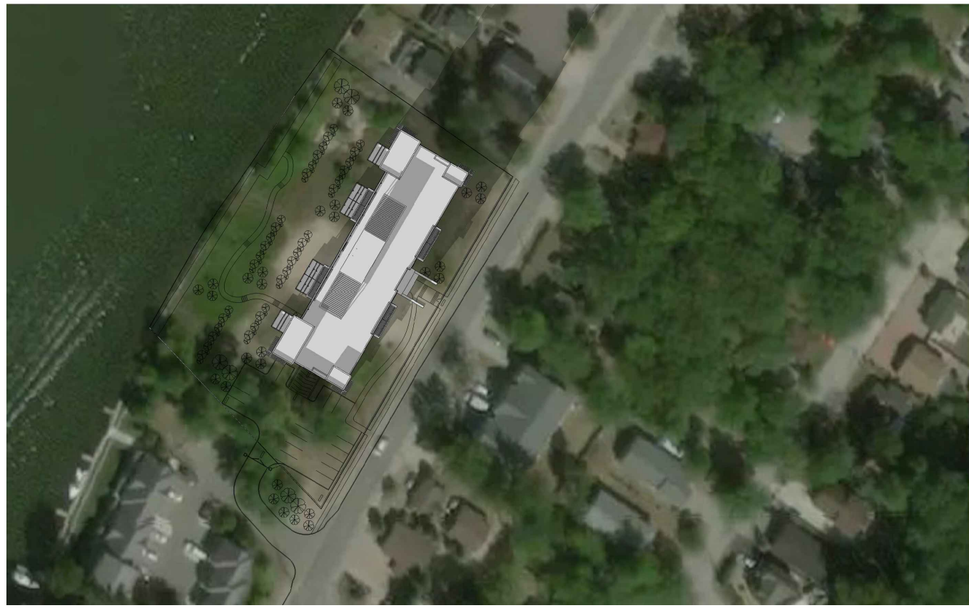
3:00 DEC 21 AFTERNOON SHADOWING AFFECTS 3 PROPERTIES TO NORTH, BUILDINGS PARTIALLY SHADED