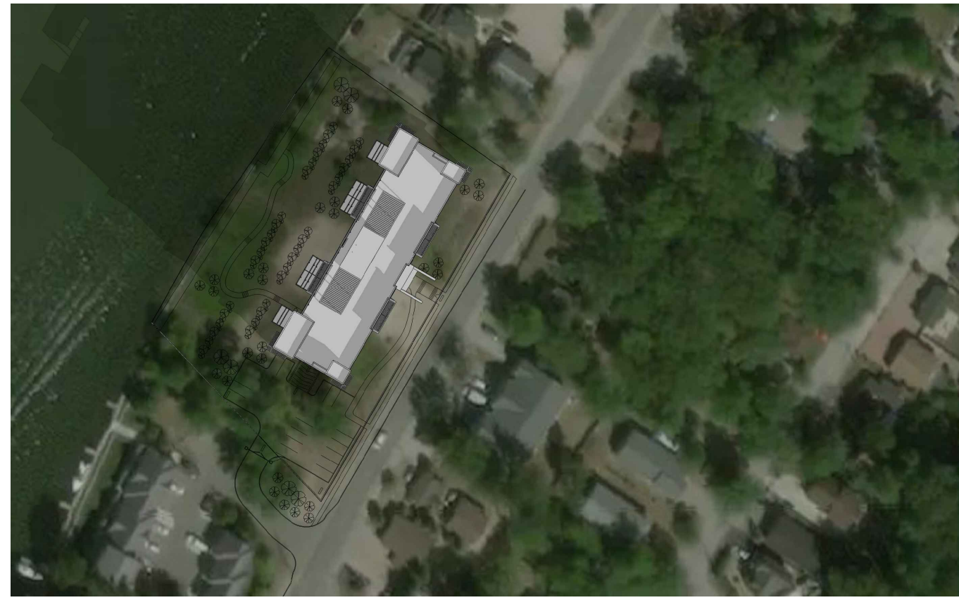
9:00 DEC 21 MORNING SHADOWING HAS NO AFFECT ON NEIGHBOURING PROPERTIES